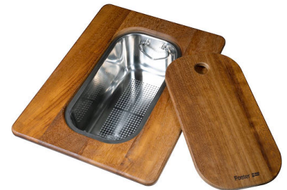
Iroko-wood sliding chopping board with stainless steel colander 8644 044

* only in combination with the accessory 8644 101