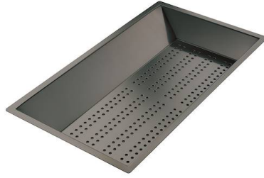
Stainless steel perforated tray PVD Gun Metal

* only in combination with the accessory 8644 101