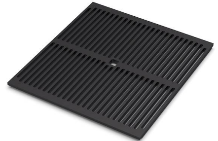
Black grid 8100 617